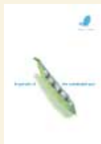
In Pursuit of the Sustainable Pea Forum for the Future in collaboration with Birds Eye (2002)