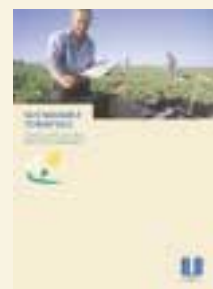
•Sustainable Tomatoes Good Agricultural Practice Guidelines (2003)

Copies of these publications and further background on Unilever and sustainability, the environment and social responsibility can be obtained from www.unilever.com (click link for environment & society) or can be requested by email on sustainable.agriculture@unilever.com . For specific information on the Unilever Sustainable Agriculture Initiative visit www.growingforthefuture.com .