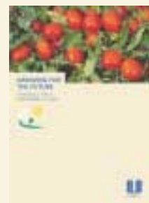
•Growing for the Future Tomatoes: For A Sustainable Future (2003)