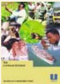
Tea – A popular Beverage Journey to a Sustainable Future (2002)