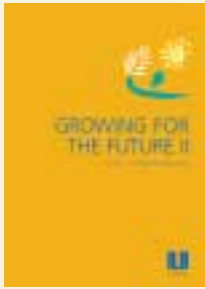
Growing for the Future II Unilever and Sustainable Agriculture (2002)