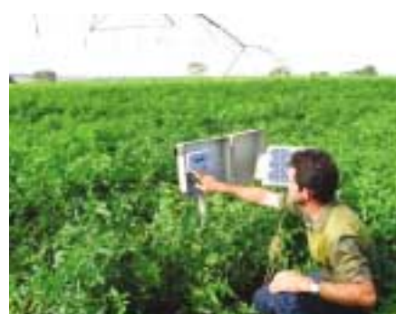
Sustainable agriculture indicators 8, 6, and 4: water, product value and pest management. Drip irrigation (left) saves water and increases yields. Speed is the essence in maintaining the quality of a tomato crop between field and factory (top). A Brazilian farmer (above) checking computer field equipment designed to predict disease proliferation.