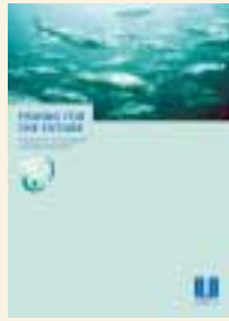
Fishing for the Future Unilever's Sustainable Fisheries Initiative (2002)