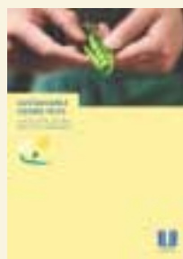
*Sustainable Vining Peas Good Agricultural Practice Guidelines (2003)