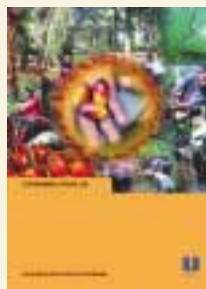
Sustainable Palm Oil Good Agricultural Practice Guidelines (2003)