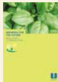
*Growing for the Future Spinach: For A Sustainable Future (2003)