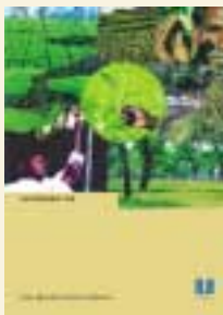
Sustainable Tea Good Agricultural Practice Guidelines (2002)