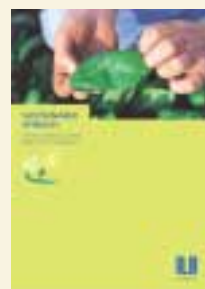
*Sustainable Spinach Good Agricultural Practice Guidelines (2003)