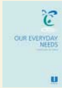
Our Everyday Needs Unilever's Water Care Initiative (2001)