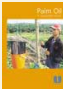
Palm Oil A Sustainable Future (2001)