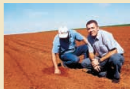
Checking the earthworm population (top and above right). Large earthworm populations help to maintain soil structure and aeration, nutrient cycling and drainage, as well as breaking down organic matter. Other local fauna species, such as carabid beetles, are useful indicators too.