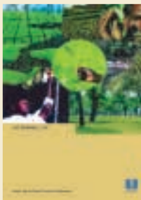
Sustainable Tea Good Agricultural Practice Guidelines (2002)