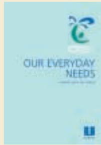
Our Everyday Needs Unilever's Water Care Initiative (2001)