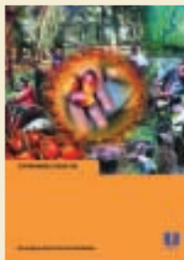
Sustainable Palm Oil Good Agricultural Practice Guidelines (2003)