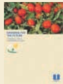
*Growing for the Future Tomatoes: For A Sustainable Future (2003)