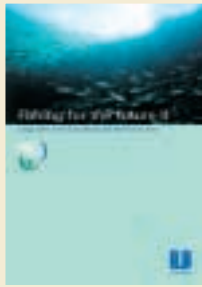
Fishing for the Future II Unilever's Fish Sustainability Initiative (FSI) (2003)