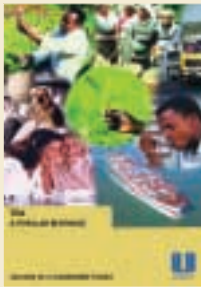
Tea – A popular Beverage Journey to a Sustainable Future (2002)