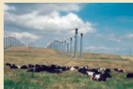
Large fields (left) enable farmers to use very wide machinery, so minimising the number of passes needed through a field which not only helps in preventing soil compaction but saves energy too. In California (above) wind farms supplement systems which generate energy by conventional methods.