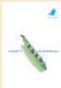
In Pursuit of the Sustainable Pea Forum for the Future in collaboration with Birds Eye (2002)