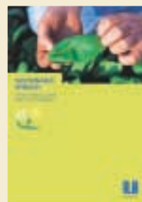
*Sustainable Spinach Good Agricultural Practice Guidelines (2003)