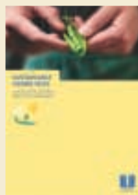
*Sustainable Vining Peas Good Agricultural Practice Guidelines (2003)