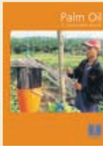
Palm Oil A Sustainable Future (2001)