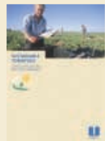
*Sustainable Tomatoes Good Agricultural Practice Guidelines (2003)

If you wish to read more about our sustainable agriculture programme, please look at the Unilever website at www.unilever.com/environmentandsociety/sustainability Specific documents, protocols, brochures, etc. can be found at www.growingforthefuture.com or email us at sustainable.agriculture@unilever.com