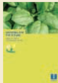
*Growing for the Future Spinach: For A Sustainable Future (2003)